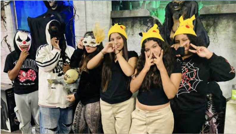
Peer Groups decide on "Bigs Nights Out" (a visit to Spirit Halloween in 2023)