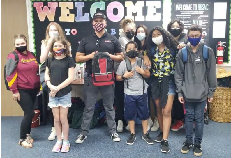
Annual back-to-school backpack and supplies distribution