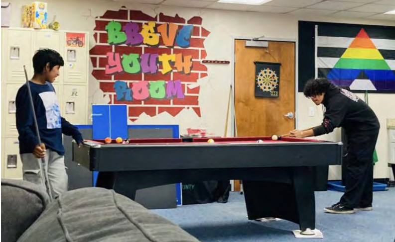
Open Room time for Small Peer Groups (approx. 5-6 youth per group)