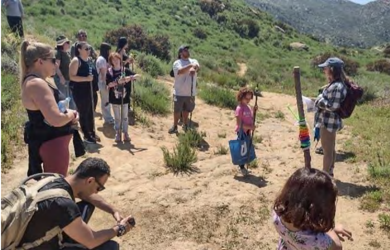
Bigger agency group outings and field trips (The guided “Big Hike” in April 2023 at Corriganville)