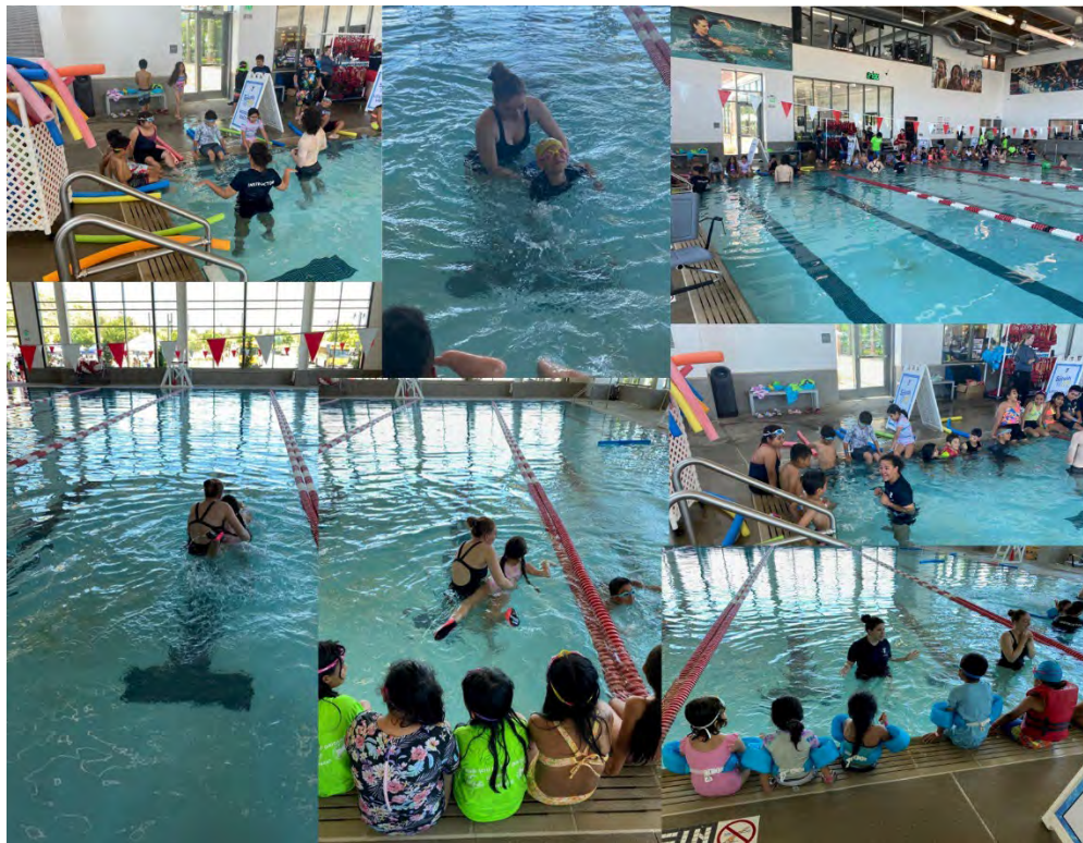
Images of SAW Participants in our Yarrow Family YMCA facility