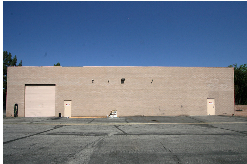
WEST ELEVATION (BACK) - PROPOSED