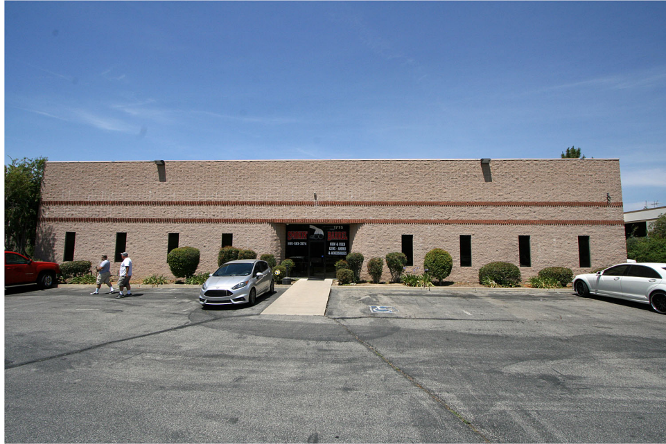
EAST ELEVATION (FRONT)