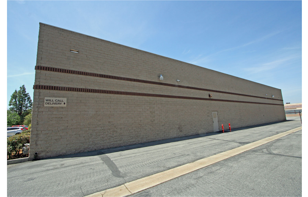
NORTH ELEVATION (SIDE)