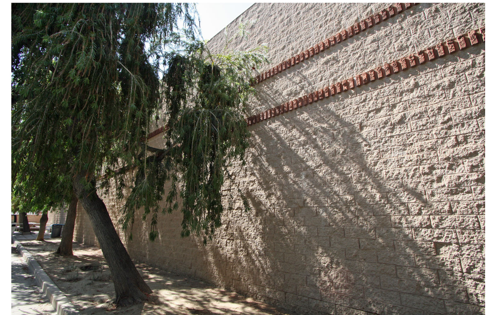
SOUTH ELEVATION (SIDE)