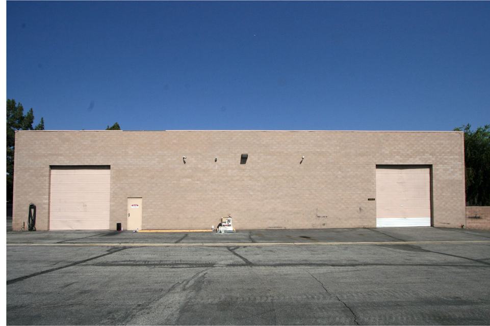
WEST ELEVATION (BACK) - EXISTING